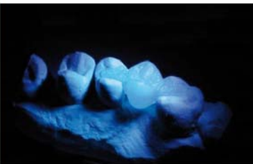
9 Light cure