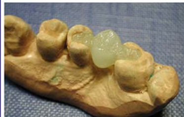
10 Polishing / Finishing