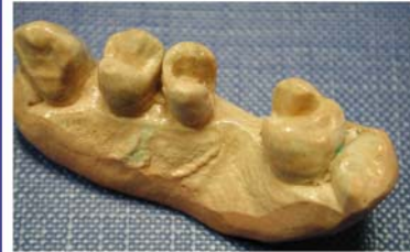
2 Laboratory model