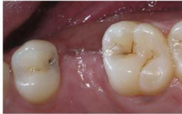
1 Clinical case