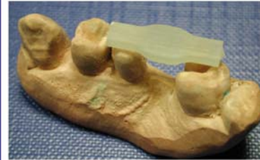
3 Select size