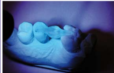
7 Light cure