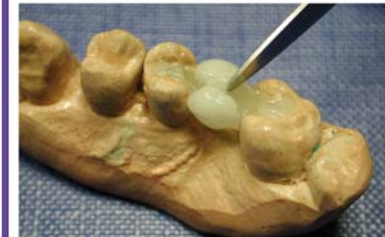
8 Composite sculpture