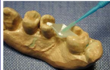
6 Prime / Remove Excess.